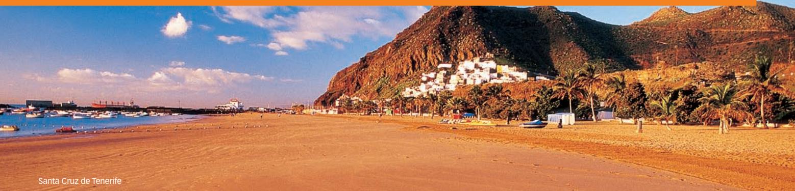
Santa Cruz de Tenerife